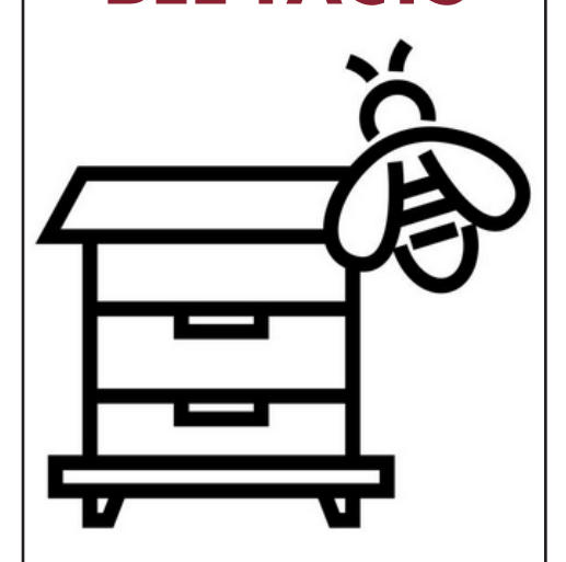
Did you know?

1 out of every 3 bites of food we eat exists because of bees.